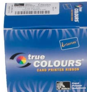
Figure 2: Zebra Box